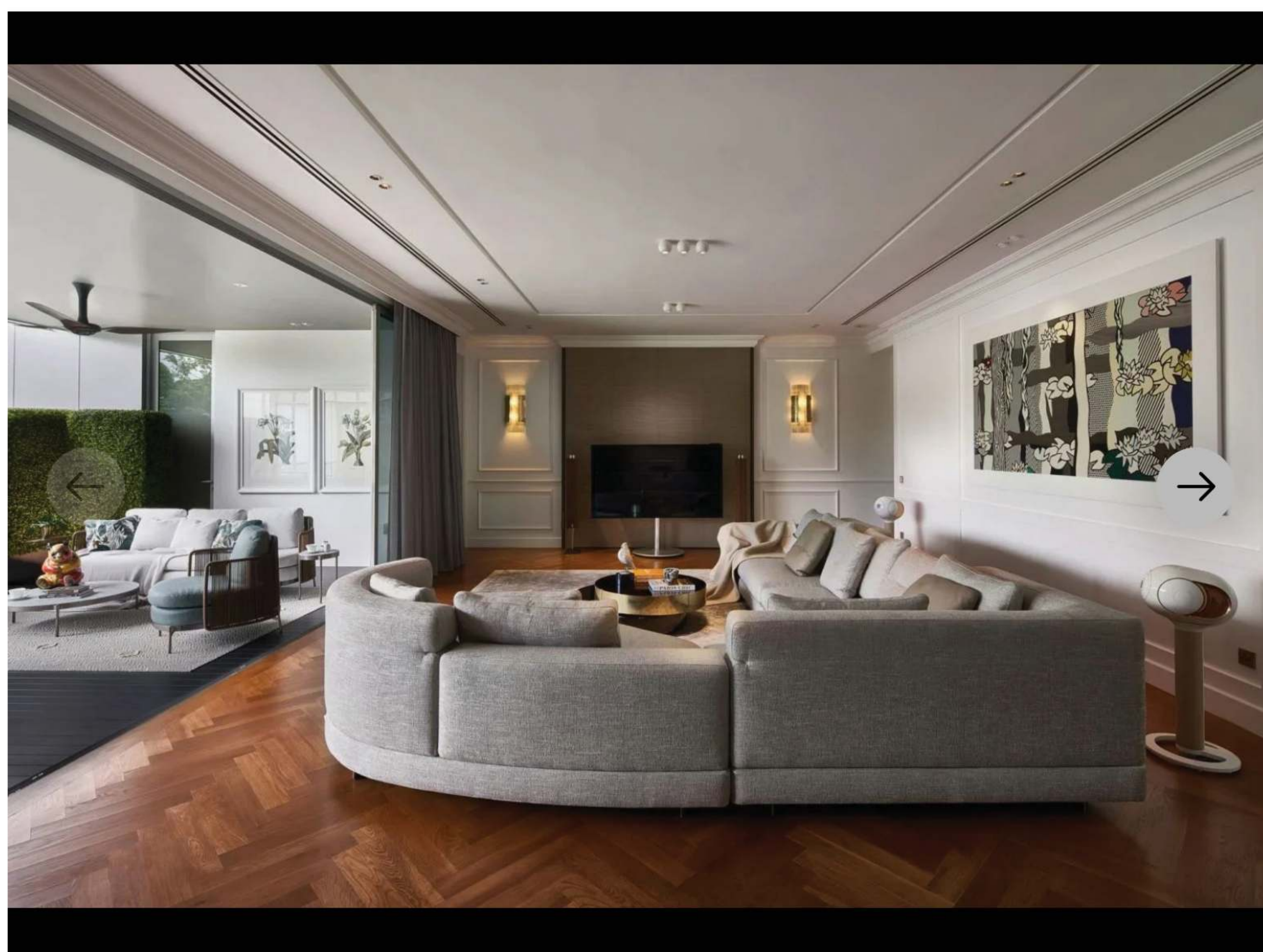
PHOTO 1 OF 3 In this French-styled apartment, the goal was to make the outdoor terrace a part of the space